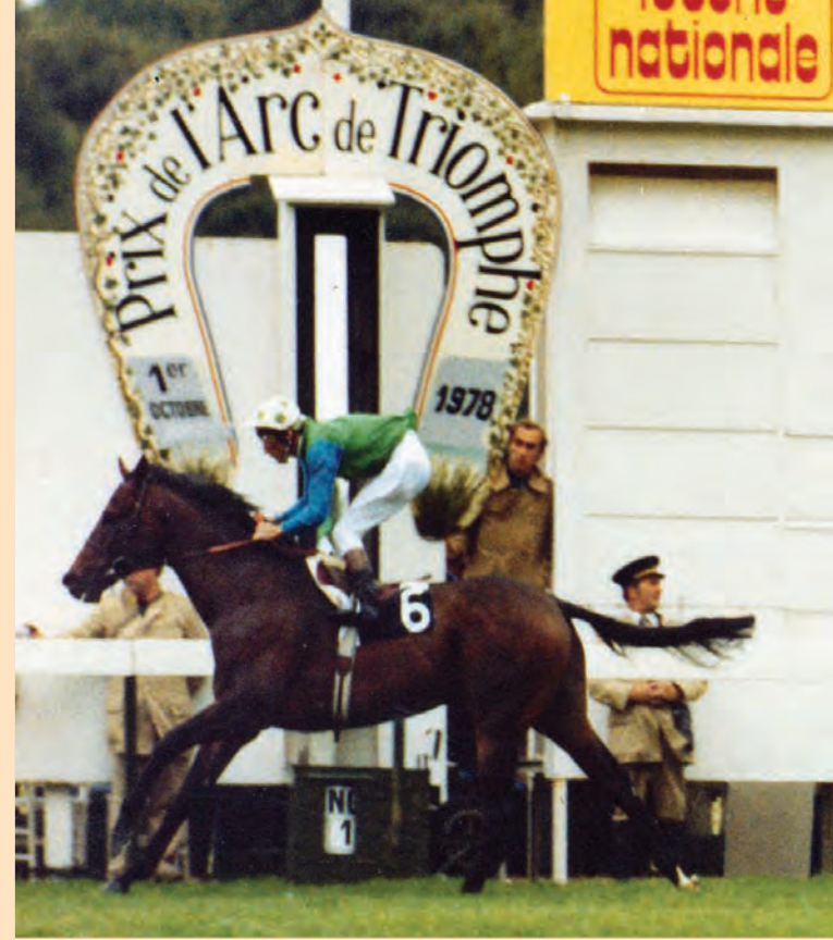
Alleged: From our track to back to back wins in the Prix de l'Arc de Triomphe